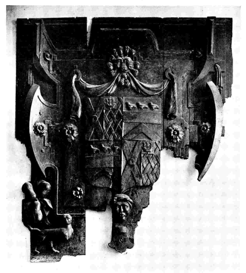
Newbourne Hall, arms of Nevill quartering Tay.